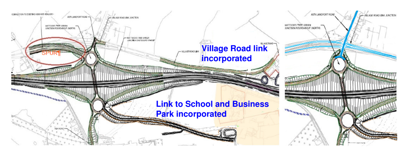
NH's plan as presented on 22-23 September 2021

Proposal 2 . Our proposal to provide a link from the Somerset Progressive School and adjacent Business Park direct to Mattock's Tree Green roundabout south is incorporated into the scheme. We recommend the incorporation of a farm track/Walker, Cyclist, Horse rider (WCH) path from this complex to West Hatch Lane.